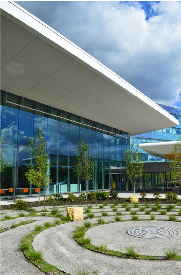
View of Garden and Labyrinth Stone at Main Hospital Entry