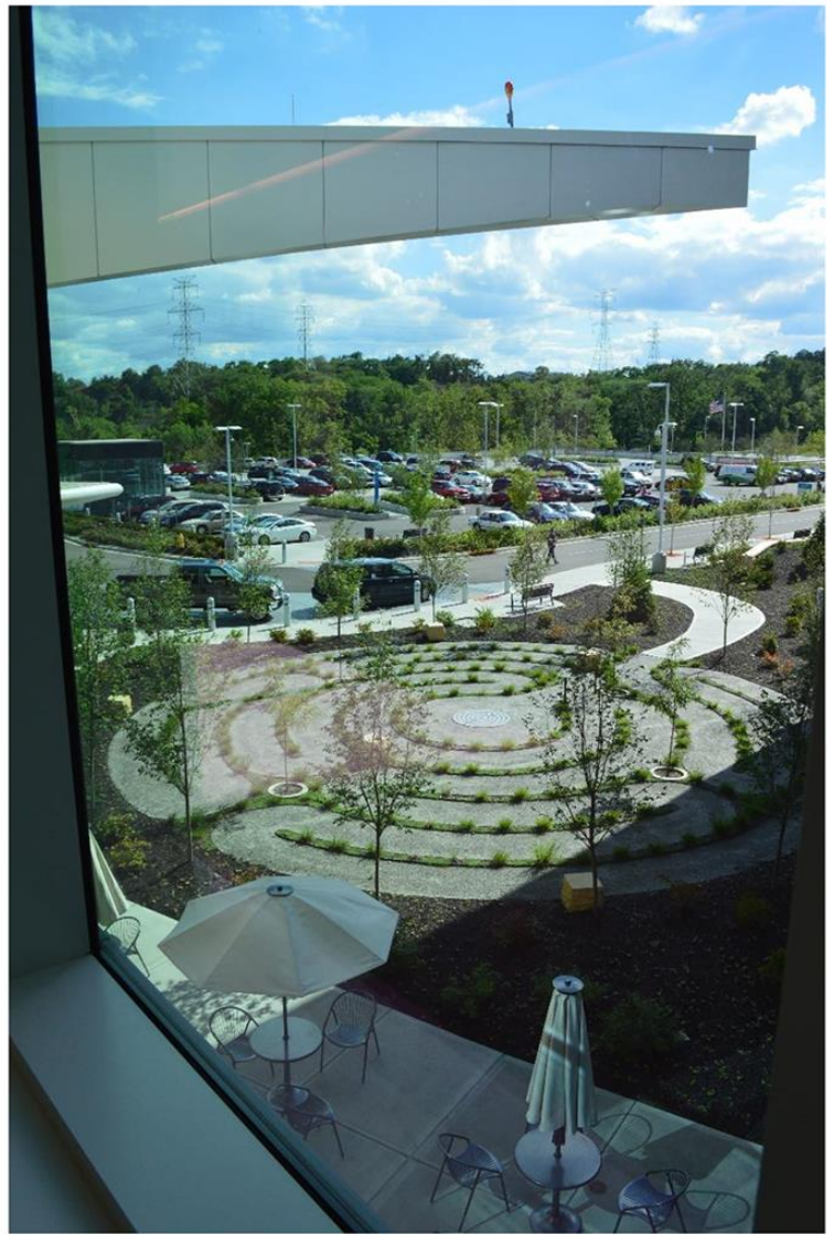
View of Garden and Labyrinth Stone from Second Floor Lobby