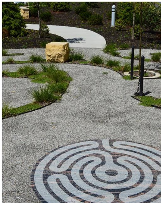
Detail View of Labyrinth Stone