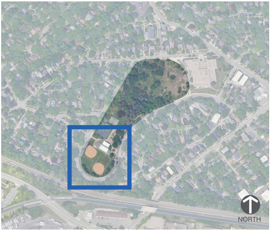
Vicinity Map LANGFORD PARK