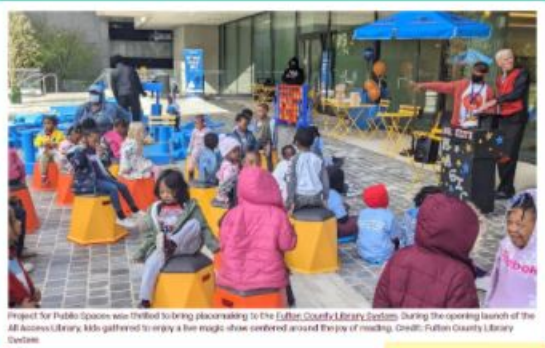
Project for Public Spaces was thrilled to bring placemaking to the Fulton County Library System. During the opening launch of the All Access Library, 100s gathered to enjoy a live music show centered around the joy of reading.

SE Corner of Bldg - What if it could be more celebrated for gathering?