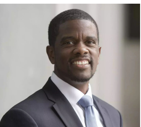
MELVIN CARTER Mayor