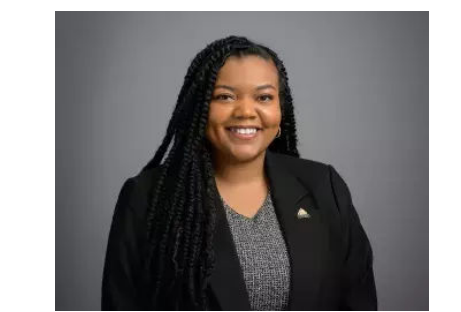
CHENIQUA JOHNSON Ward 7 Councilmember