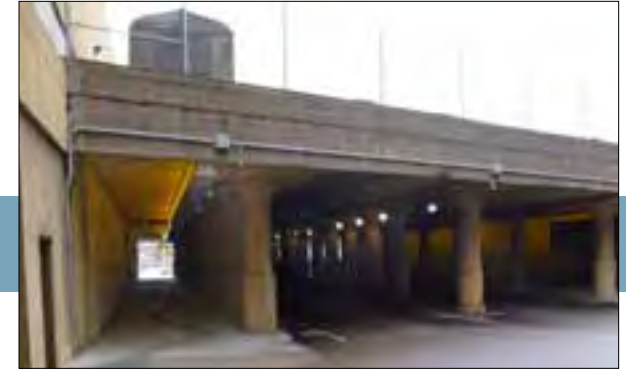
Figure 3.15 The existing condition of the Sibley viaduct.