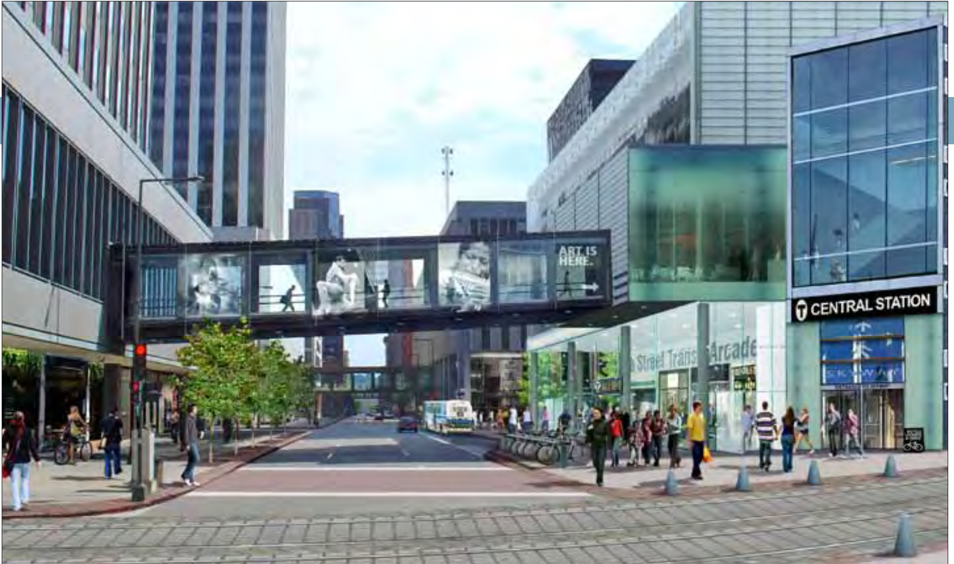
Figure 3.2 A transformed 5th Street edge with the new station integrated into the redevelopment.

The redevelopment of the Central Station block represents a tremendous opportunity to create a positive transit environment that better connects bus and LRT operations. In this illustration, a generous atrium links the LRT station with bus stops on Cedar and Minnesota. Integrating modes of transit through the redevelopment of a block such as this will help break down perceived differences between modes, encourage greater levels of street activity, and create an active, safe environment for transit users.