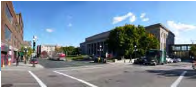
Figure 3.5 The existing condition of Union Depot.

of the Bruce Vento Nature Sanctuary. Redevelopment in this area is likely to be much less intense, especially due to constraints imposed by proximity to Holman Field, but must also transition to the Nature Sanctuary in an environmentally-sensitive way.