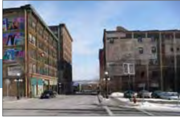
Figure 3.7 The existing condition of 4th Street east of Union Depot.