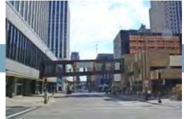
Figure 3.1 The existing condition of the northern edge of the Central Station block.

create an integrated station environment capable of supporting a range of retail uses and internal pedestrian amenities.