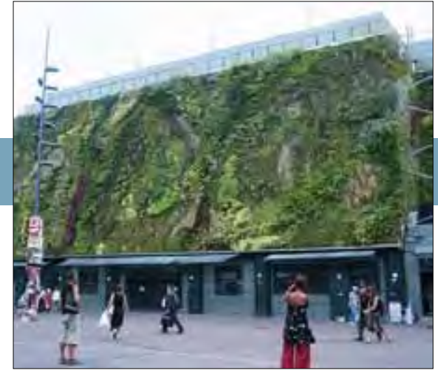
Figure 3.9 The creation of a green “living” wall on the OMF along Prince Street would help to soften the edge of the facility.

a) Explore opportunities to provide active street frontage along Broadway between Prince and 6th Streets and along Prince Street east of Broadway. Approximately 8,000 square feet have been reserved in the OMF along Broadway for this purpose. On the northern half of the site the City of Saint Paul has determined that a future ballpark - programmed for a range of minor league baseball and public recreational uses and events - represents