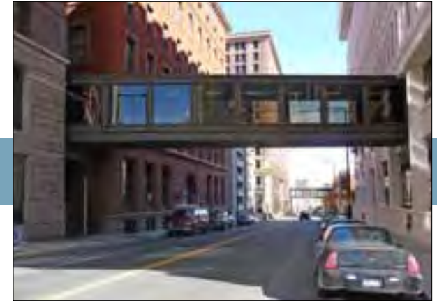
Figure 3.13 The existing condition along 4th Street.