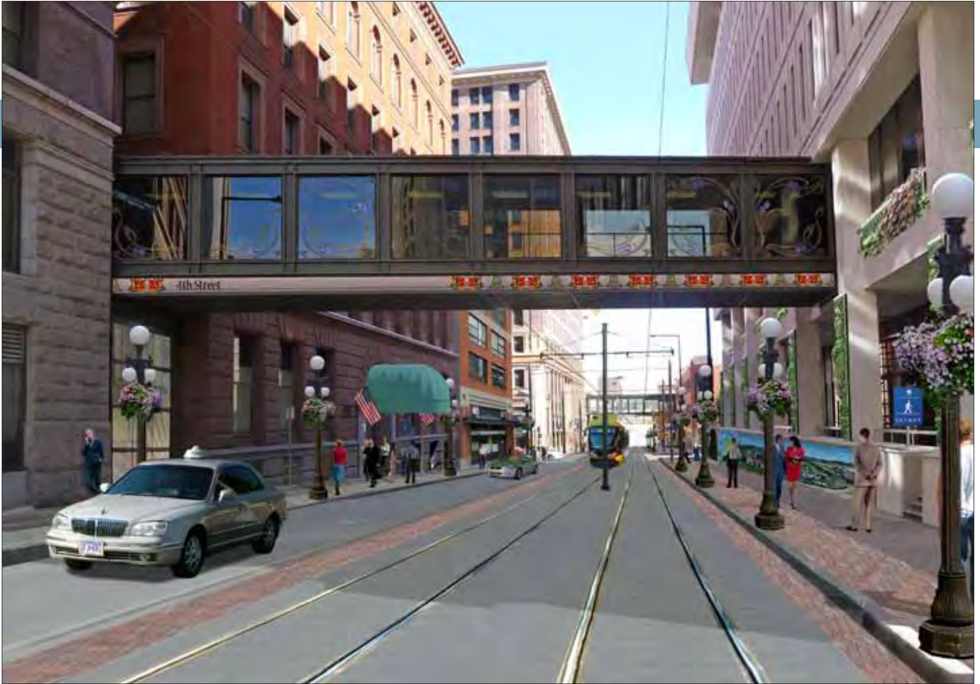
Figure 3.14 A revitalized 4th Street.

A revitalized 4th Street includes facade improvements, improved skyway connections, and a range of public art expressions to create a more pedestrian-friendly environment .