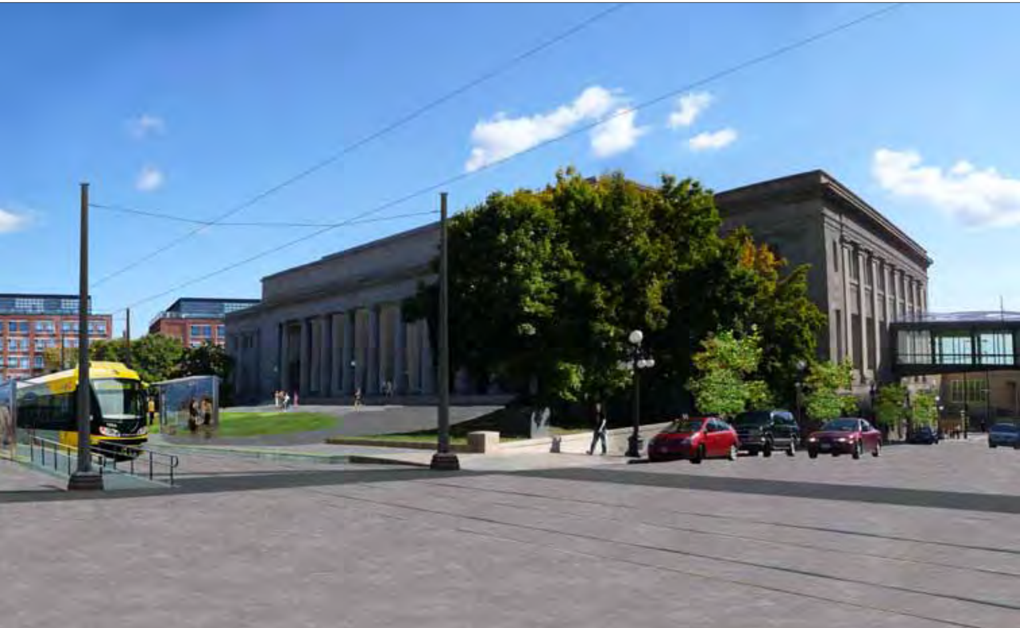
The Union Depot LRT station and adjoining plaza will provide a landmark gateway for visitors arriving in Saint Paul by LRT or another mode of transportation.