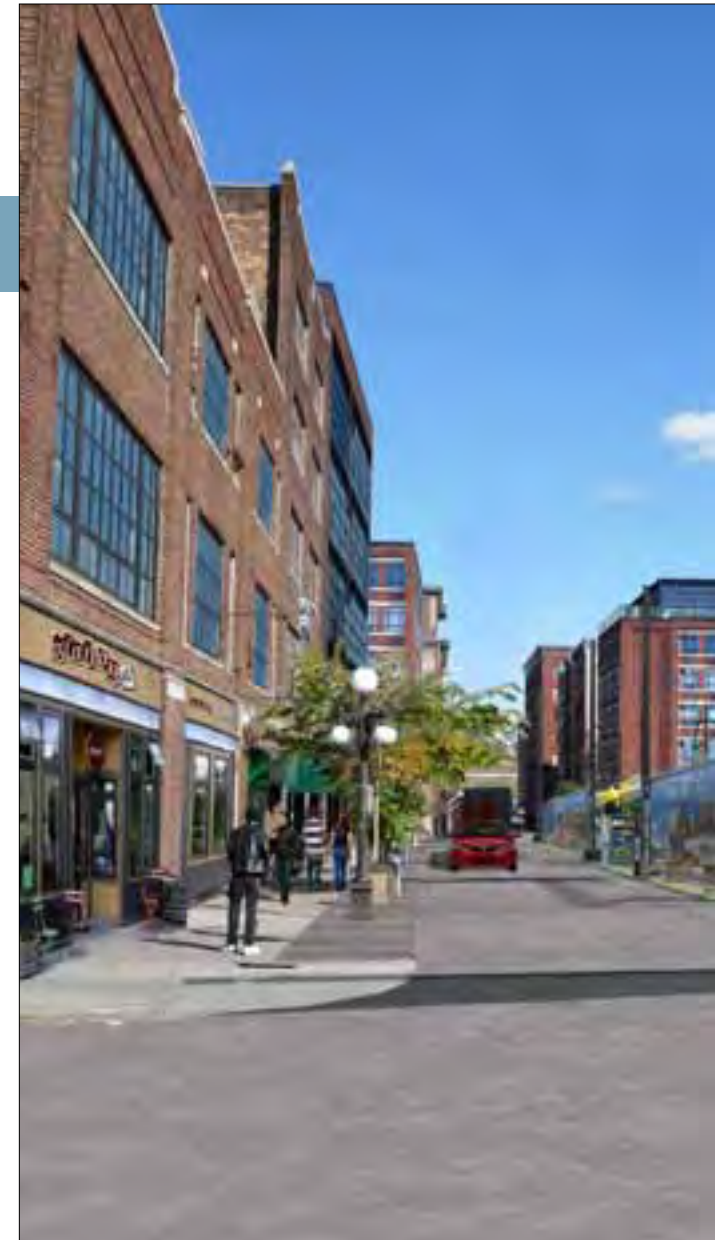
Figure 3.6 The Union Depot LRT Station.