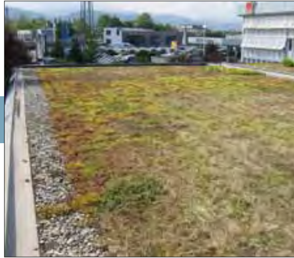
Figure 3.11 The integration of an extensive green roof atop the OMF would help trap runoff during storm events.