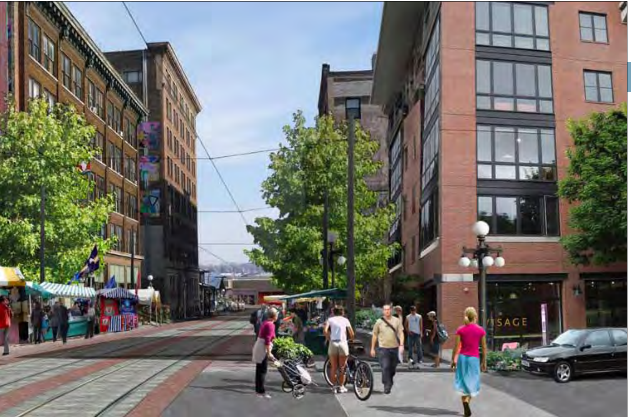
4th Street in the future may evolve to include an extended Farmers' and Artisans Market where display booths spill off sidewalks and out into streets during special events.