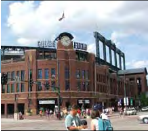
Figure 3.10 A sensitive brick façade wrapping Coors Field in Denver helps to integrate the ball park into the surrounding warehouse district.