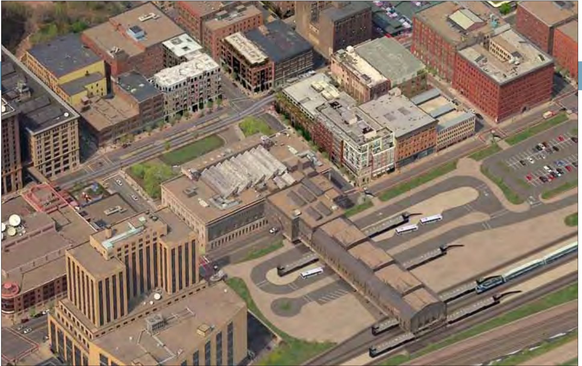
Figure 3.3 Creating an “urban room” at Union Depot.

The redevelopment of sites adjacent to Union Depot in this image will create a consistent wall of buildings that frames a new “urban room” in front of Union Depot. To the rear of the building, beneath the concourse, the train deck has been adapted to accommodate new bus and regional rail service.