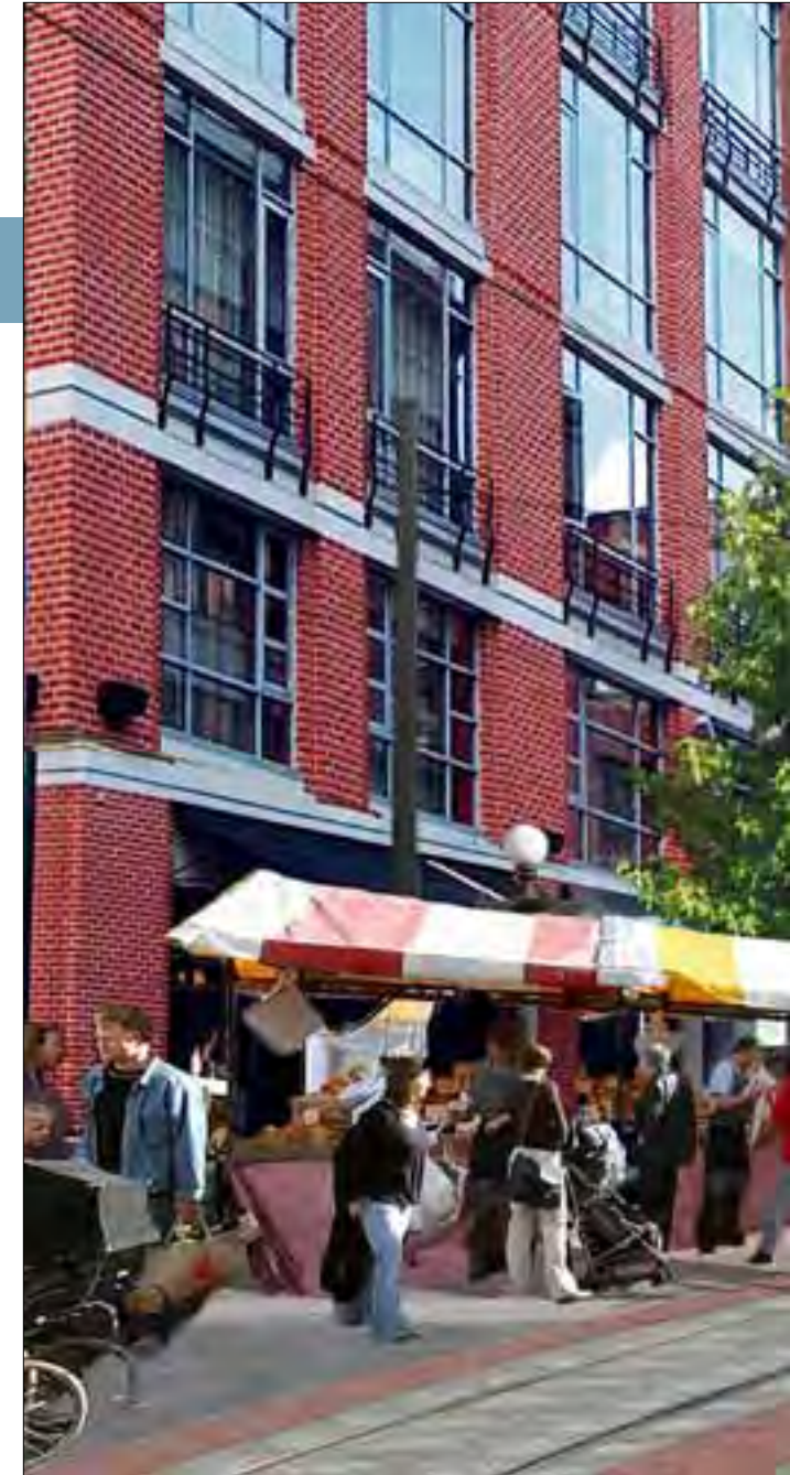
Figure 3.8 4th Street to the Farmers’ Market.

The route along 4th Street will become an increasingly important pedestrian street as LRT operations commence, and as the Lowertown community continues to expand with new cultural, residential, employment, and commercial uses. This stretch of 4th Street should become a priority project for a targeted streetscaping program aimed at promoting the successful integration of pedestrians and transit. In addition, encouraging the expansion of grade-related retail west towards Union Depot will extend the draw and energy of the Market so that one’s market experience essentially begins at the station. During special events, the City should explore the potential for street vending and additional artisan booths along 4th Street.