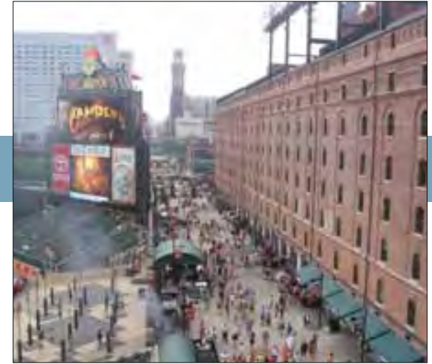
Figure 3.12 A pedestrian pathway adjacent to Camden Yards in Baltimore helps to extend the city’s fabric past the stadium and to create an interesting environment for smaller vendors.