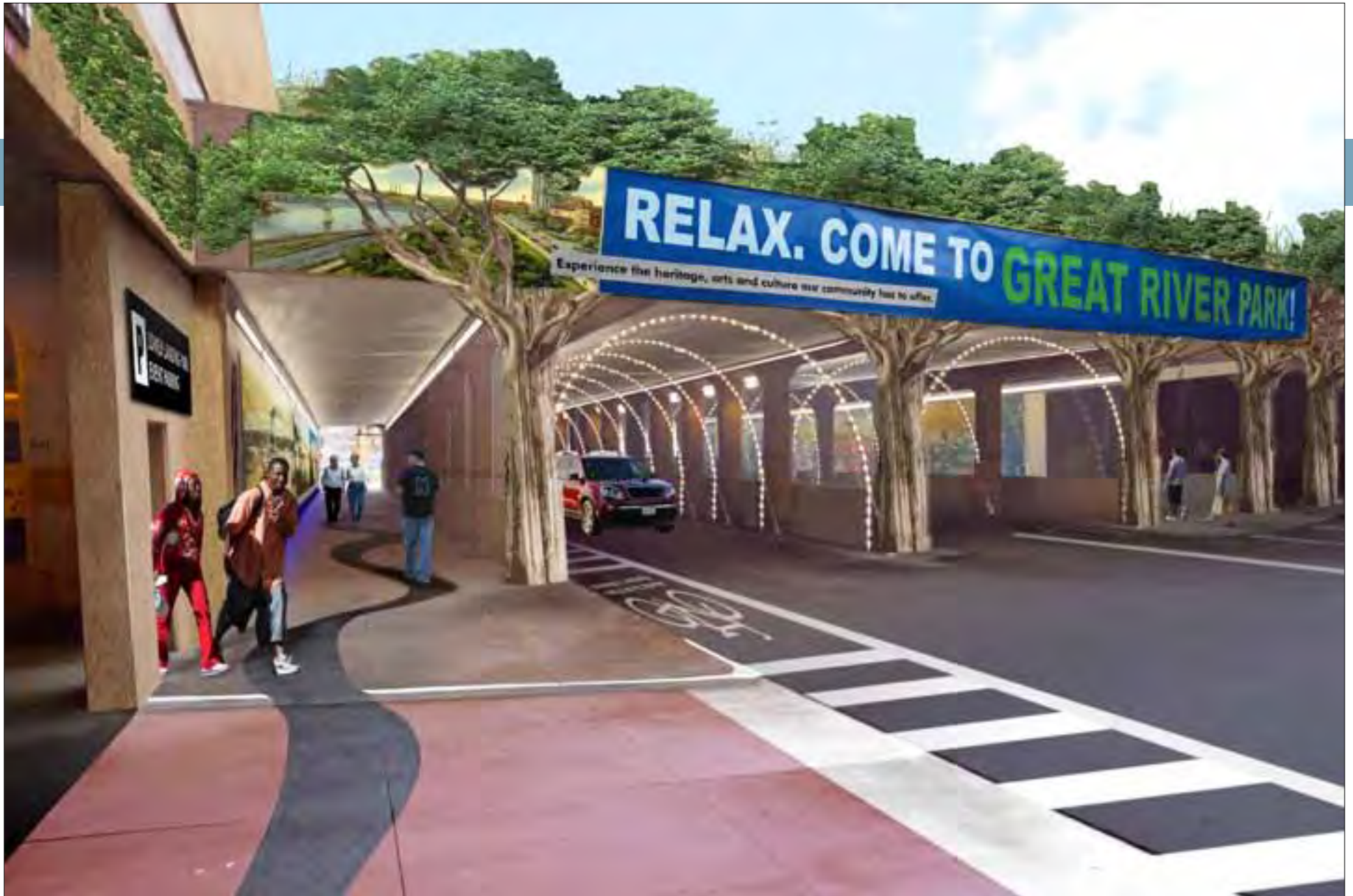
Figure 3.16 A refreshed riverfront connection along Sibley.

A renewed riverfront connection along Sibley enlivens the viaduct through entertaining and whimsical art installations, while celebrating the connection to the downtown’s surrounding natural features.