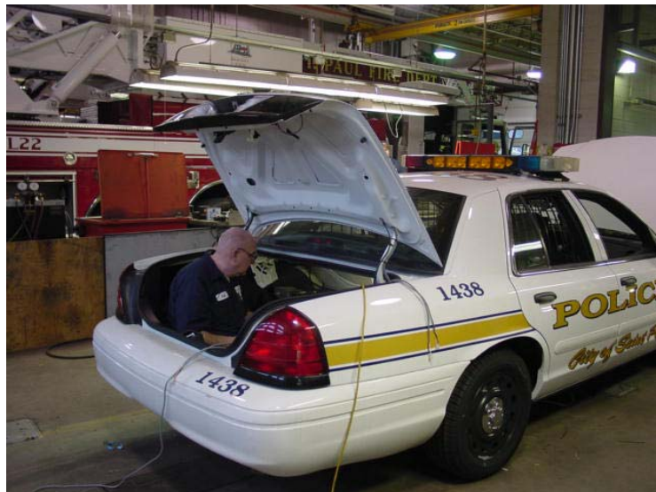
Public Safety Garage