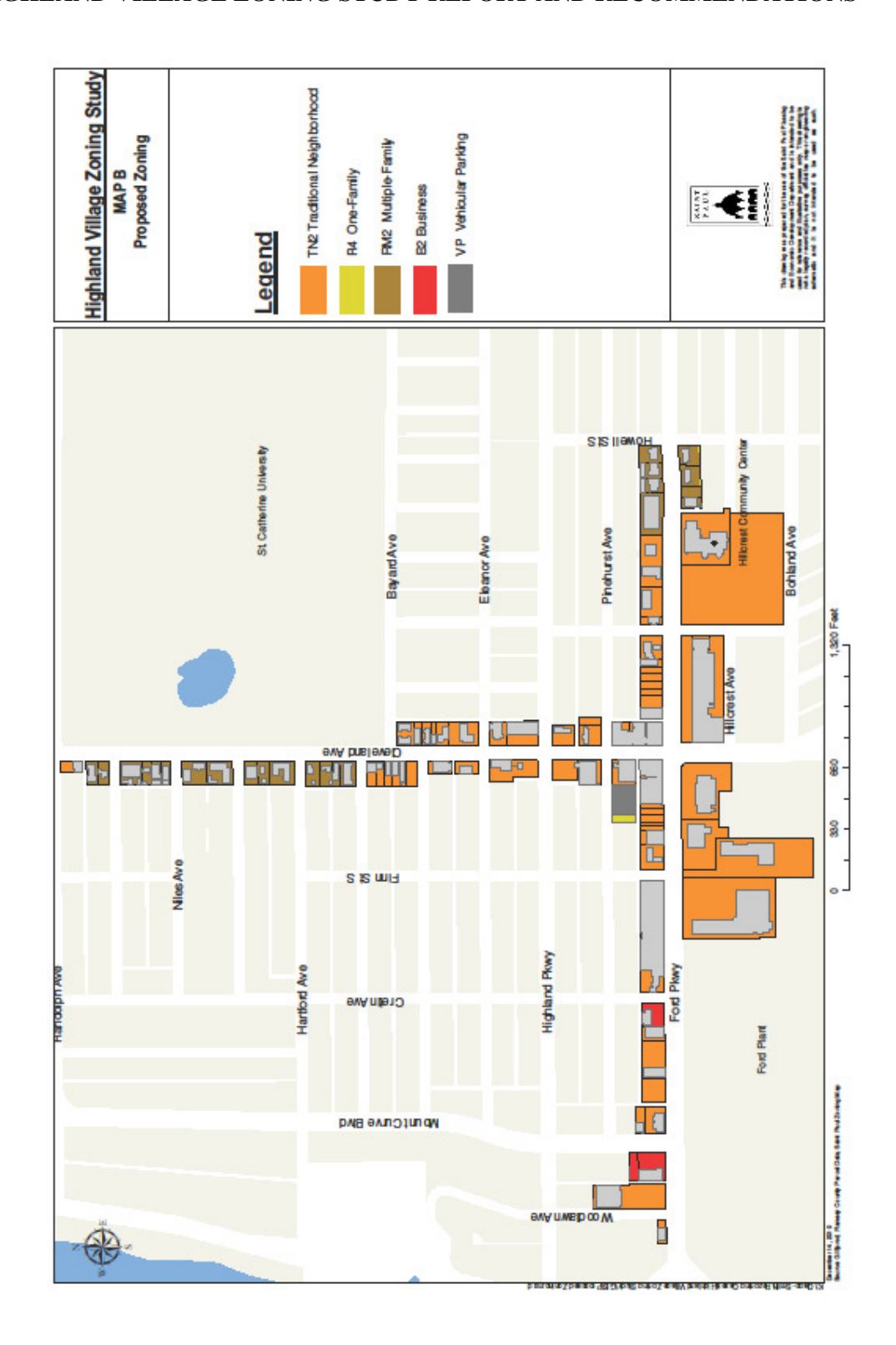
Page 10 of 14