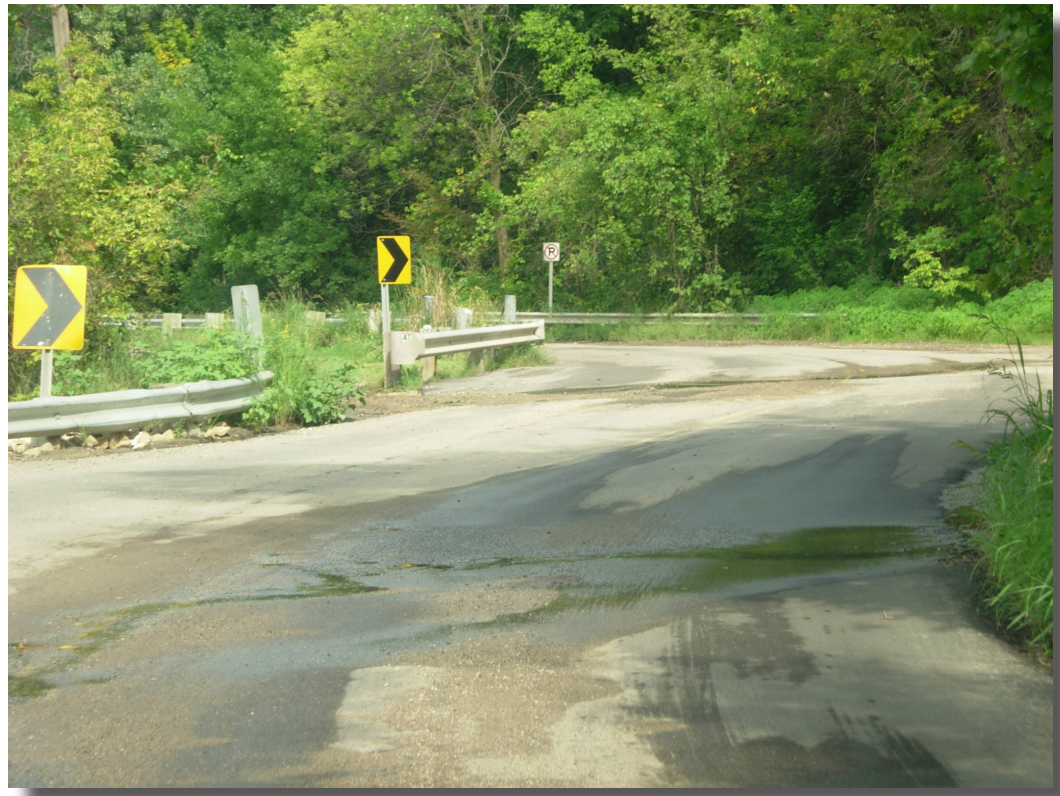
Existing roadway condition with limited site visibility and shared roadway with regional trail.