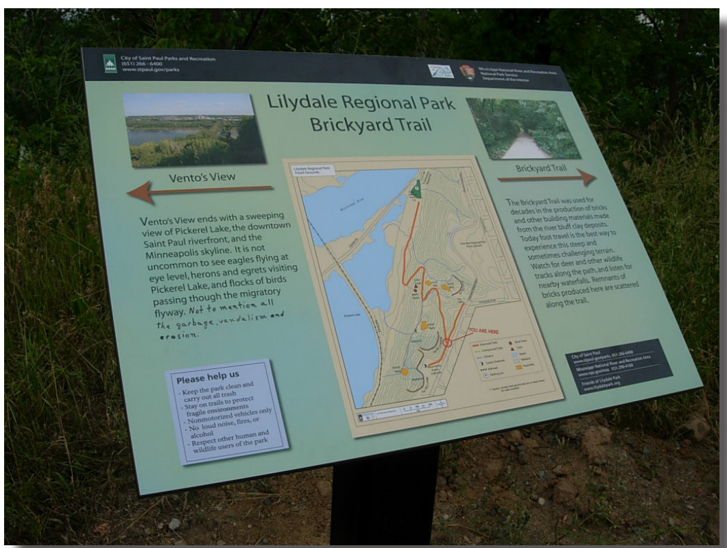
Seven interpretive signage panels currently existing along Fossil Ground Trail.