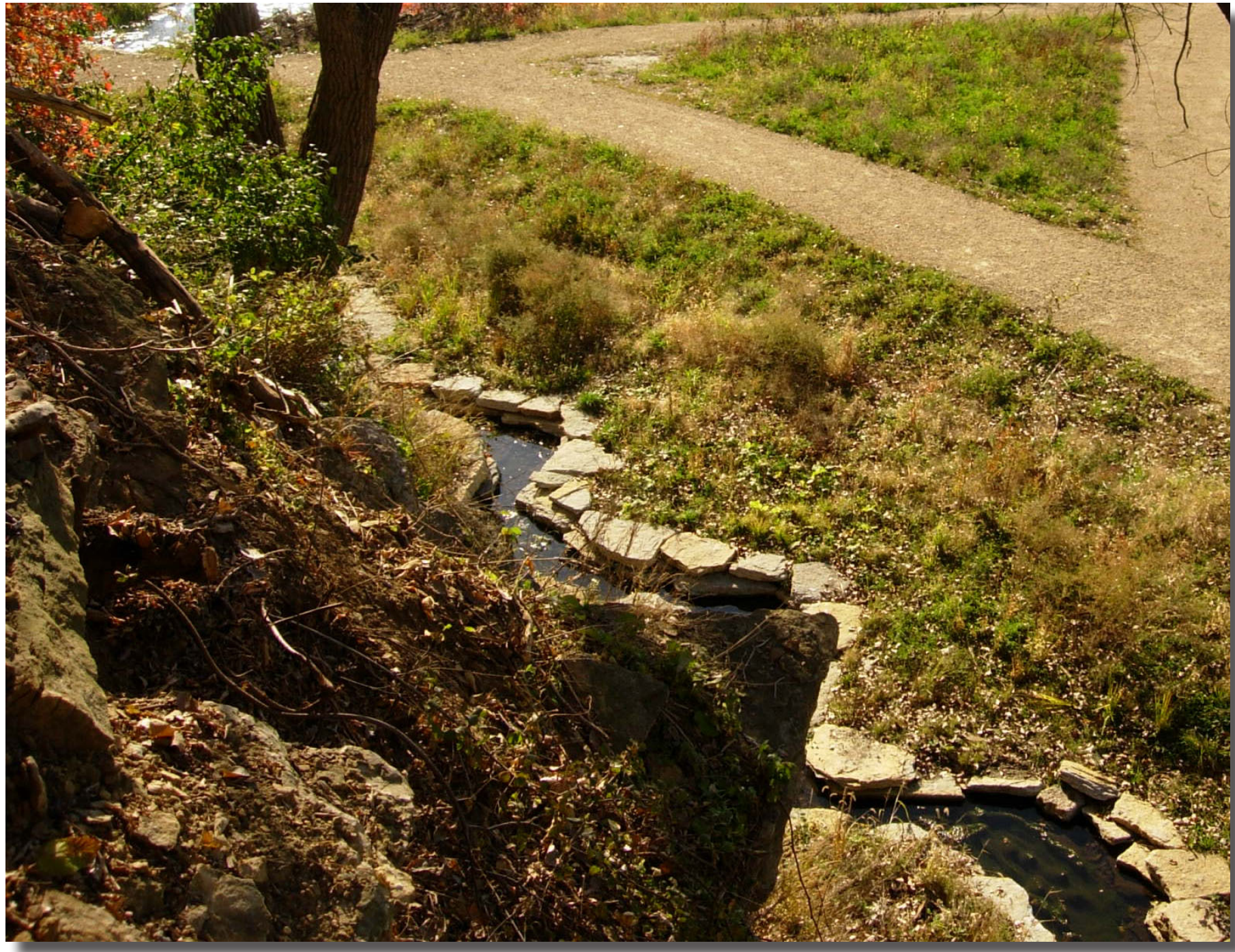
Creek bed example from Bruce Vento Nature Sanctuary. Bluff seepage is collected in limestone channel and directed to wetlands.

Roadway improvements include the creation of a creek bed installed along the base of the bluff. The creek will collect seepage from the bluffs and channel it to specific outlets