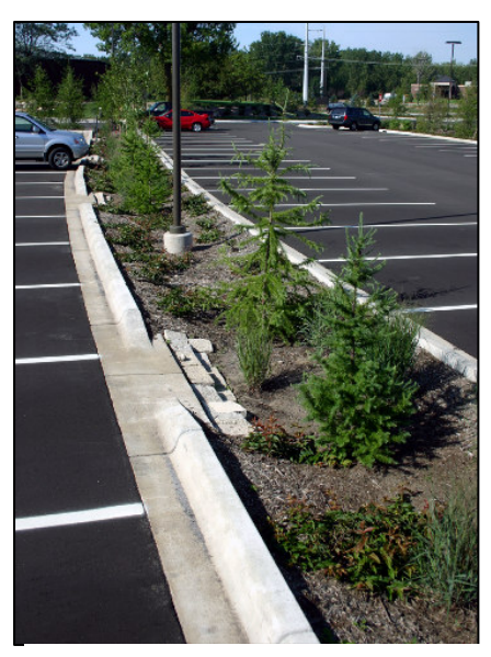
Rainwater gardens in Minnetonka City Hall's parking lots treat stormwater. Project by Barr.

Parking lots present many opportunities for impervious surface reduction. The availability of