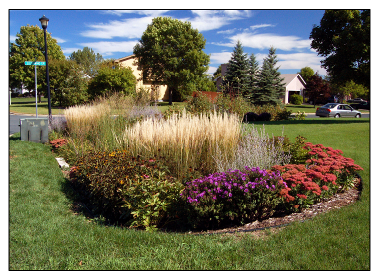
Native plantings like this in Burnsville can be contained to a rainwater garden or planted over a much larger area to provide stormwater treatment. Project by Barr.

spaces provided by the root structure can dramatically improve the capacity of the soil