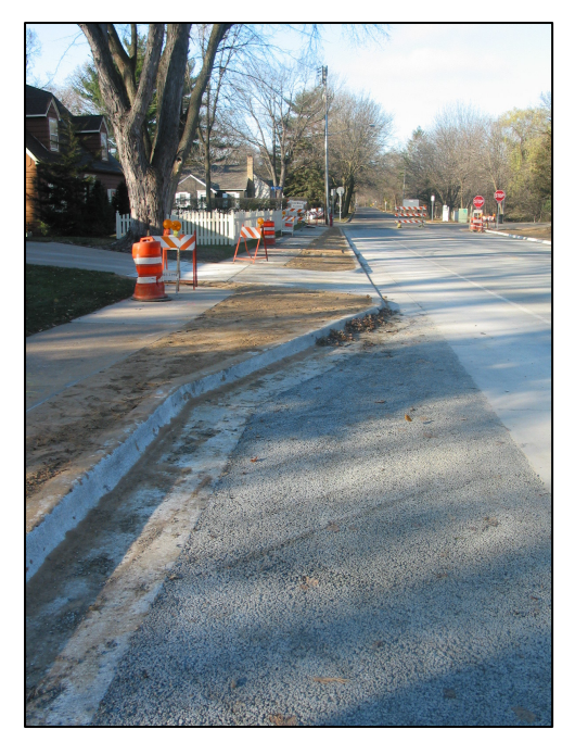
Porous pavement used in parking bumpouts to treat stormwater in Minneapolis. Project by Barr.

The first step is careful site design. A low impact development design approach including