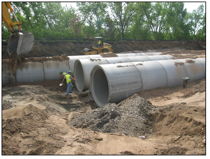
Underground storage can be used for infiltration or storage for potential stormwater reuse, as was done by American Iron in their metal scrapping processes. Project by Barr.

The goals for redevelopment of the Ford Plant site are very ambitious; however they are attainable with further investigation to more clearly understand the groundwater movement through the bedrock and to document the full extent of the impact. There are significant challenges to