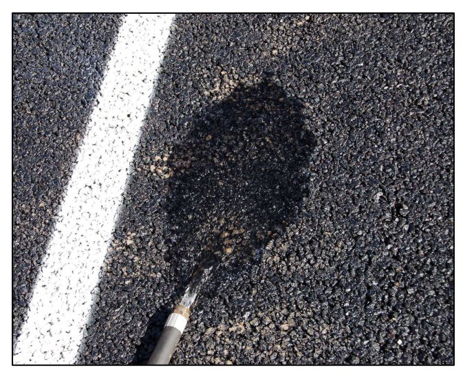
Porous Pavement at Ramsey Washington Metro Watershed District's new offices. Project by Barr.

Streets can be designed in a way to allow further reductions in impervious surface area. Street widths can be reduced to minimize impervious area. Parking bumpouts can be used with narrower lanes between the bumpouts, or streets can be designed as narrow one-way streets, with or without parking bumpouts. Additionally, pervious surfaces can be employed in the street design, such as permeable pavers or porous pavement. Barr designed a stretch of road in