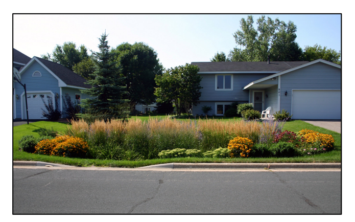
Rainwater gardens in Burnsville reduced volume by over 90 percent. Project by Barr.

Rainwater gardens are vegetated basins that collect and infiltrate the first flush of stormwater runoff. Rainwater gardens are typically designed to accommodate the runoff from no more