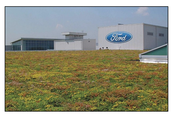
Ford's Rouge Plant in Dearborn, Michigan has the world's largest green roof.

Green roofs are becoming more common, particularly in dense urban areas where little room for stormwater management is available on site. Green roofs can capture small rainfalls and release the water to the atmosphere by evapotranspiration. Green roofs can be expensive due to the heavy weight of the soil, which requires the entire structure to be built to withstand greater dead load. Green roofs are especially