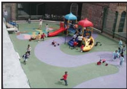
SYNTHETIC POURED IN PLACE SURFACING