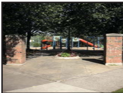
BRICK PILLARS AT ENTRY