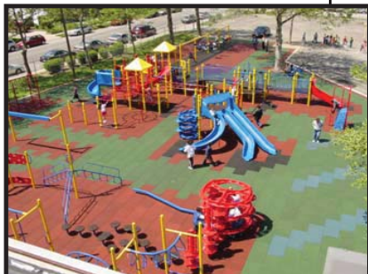
SOFT TILE SURFACING