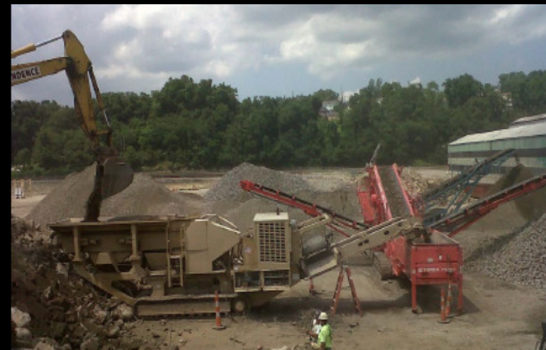
Good concrete crushed for reuse