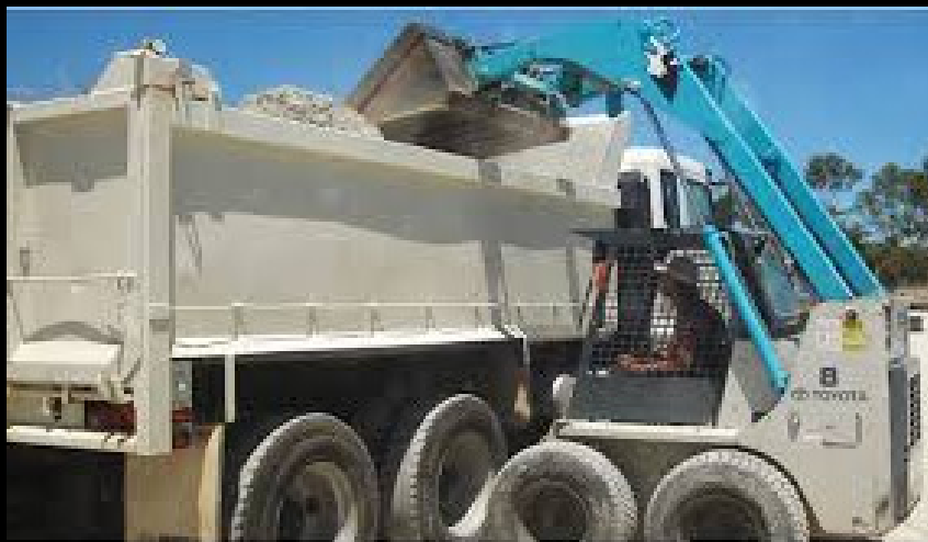
“Impacted” concrete is removed