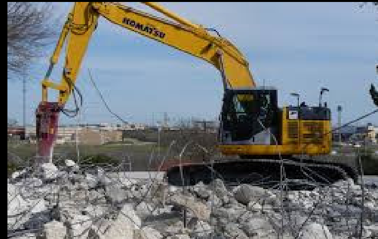
Removing rebar from concrete