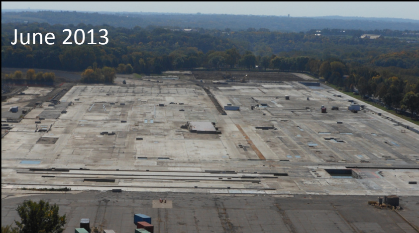
Main assembly plant slab