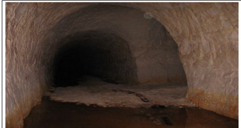
Picture No. 25 – Profile of tunnels near area of most intense sand mining