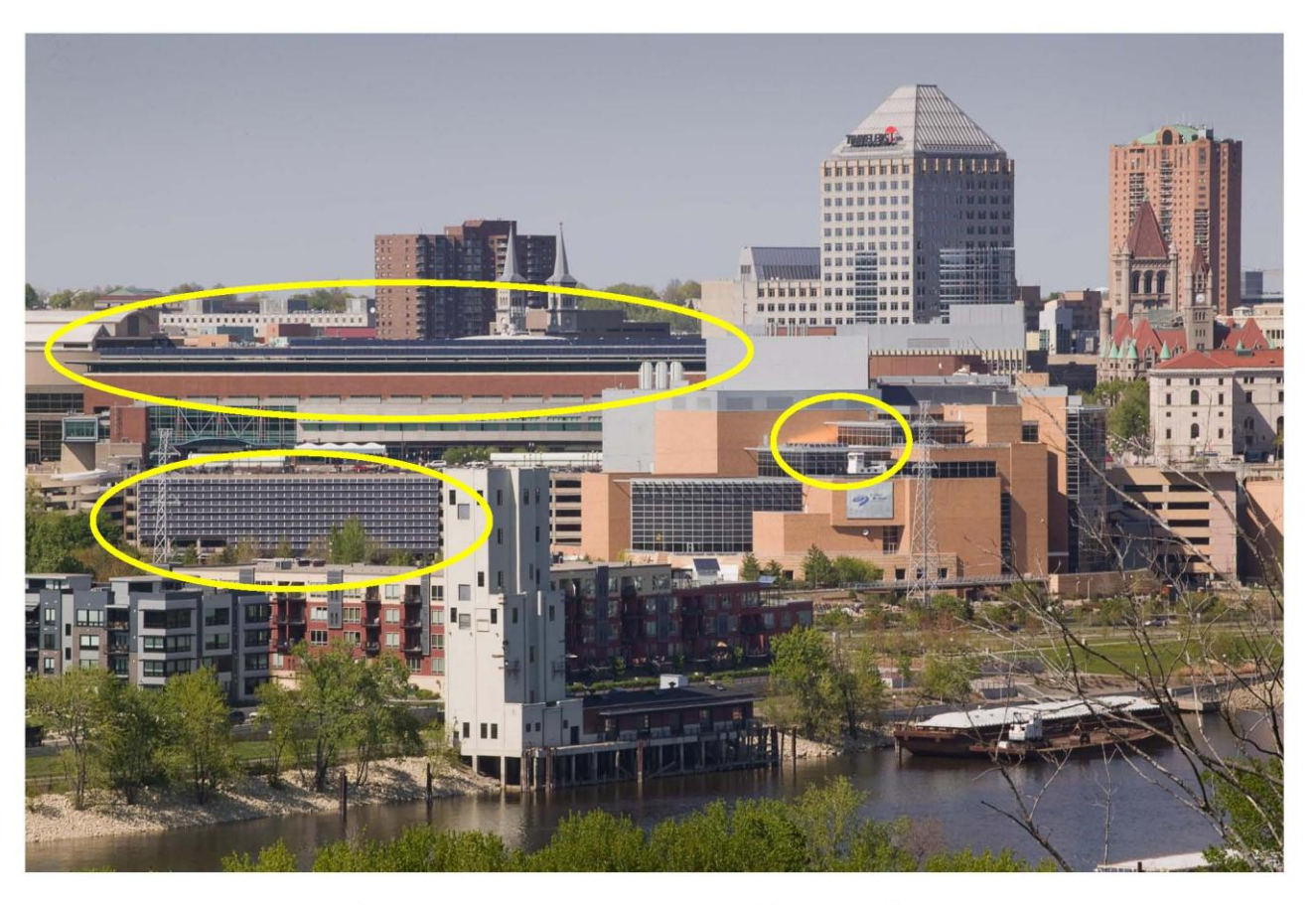
Multiple Energy Innovation Corridor Installations