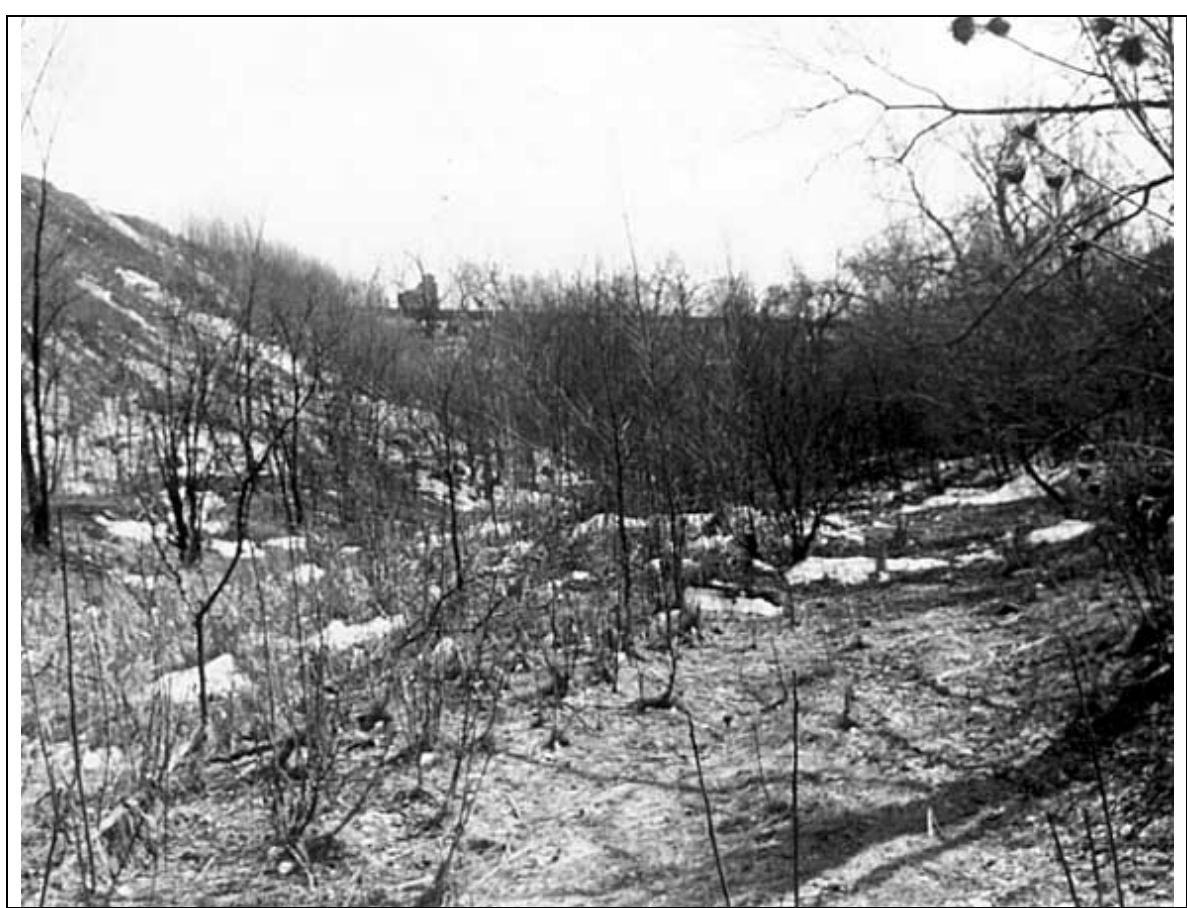
Swede Hollow, St. Paul ca. 1965