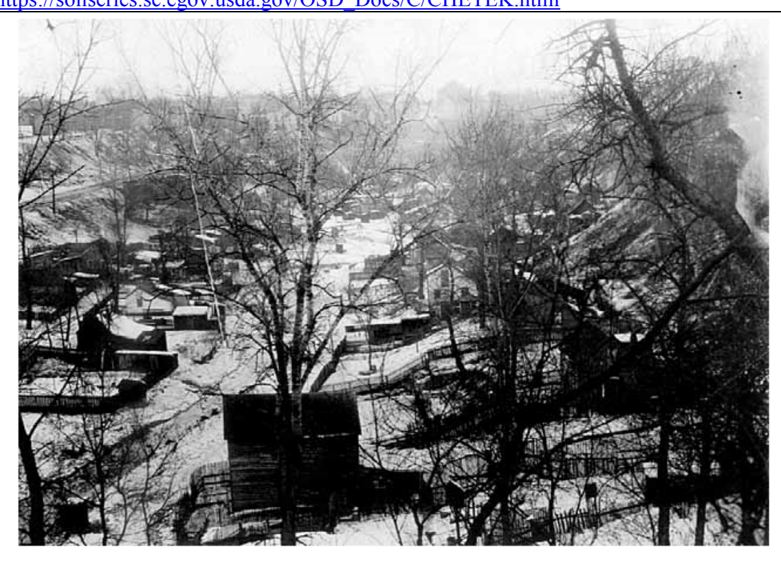
View of Swede Hollow from Seventh Street toward East Minnehaha Street, St. Paul. Photograph Collection 1925 Location no. MR2.9 SP2.2 r10 Negative no. 11418

https://soilseries.sc.egov.usda.gov/OSD_Docs/D/DORERTON.html https://soilseries.sc.egov.usda.gov/OSD_Docs/C/CHETEK.html