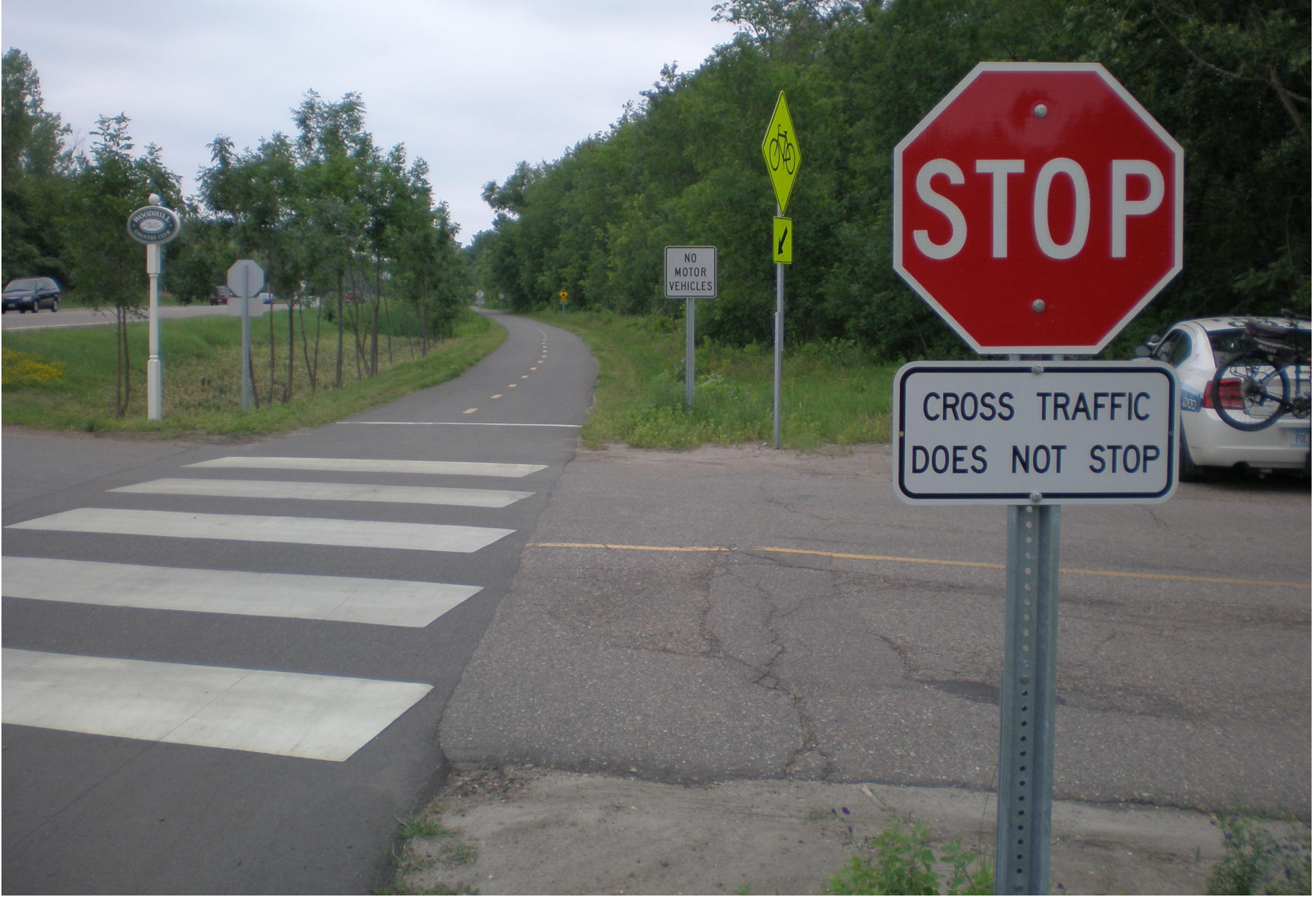
Crossings and Safety Improvements