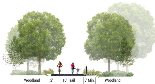
Dakota County / South St. Paul - Typ. Section D1