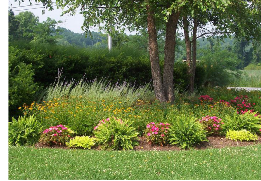
Replant Flower Beds