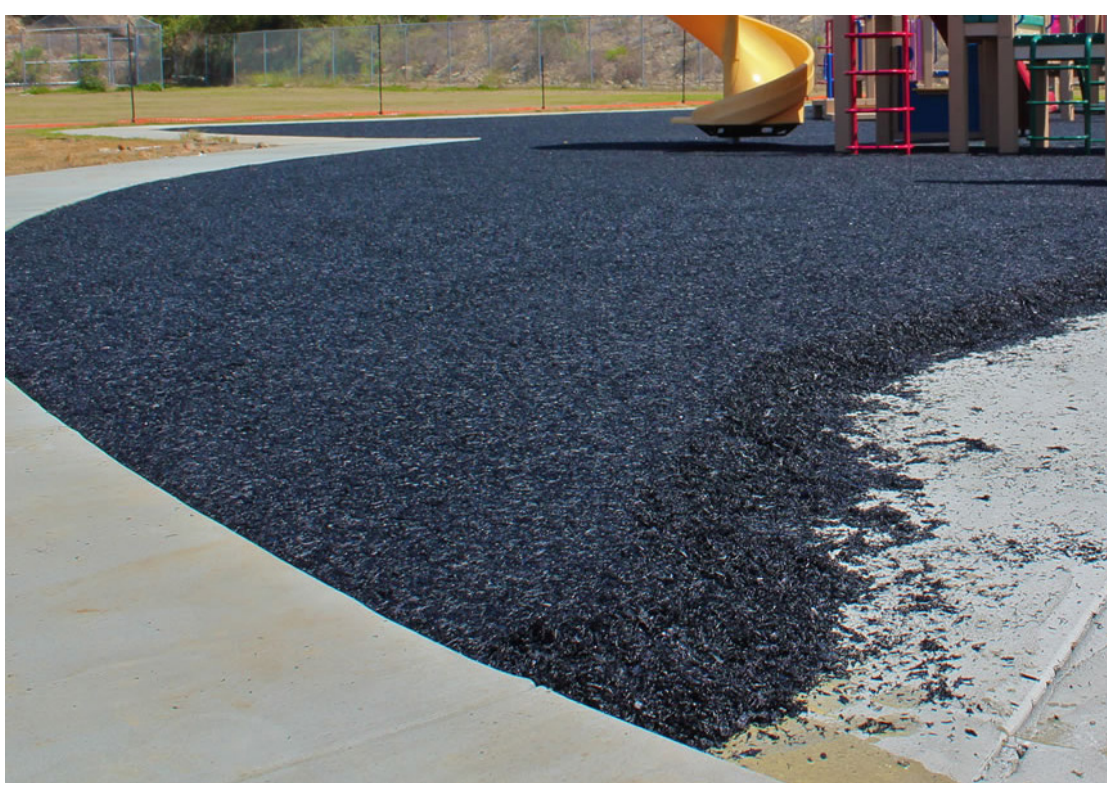
Replace Play Area Surface