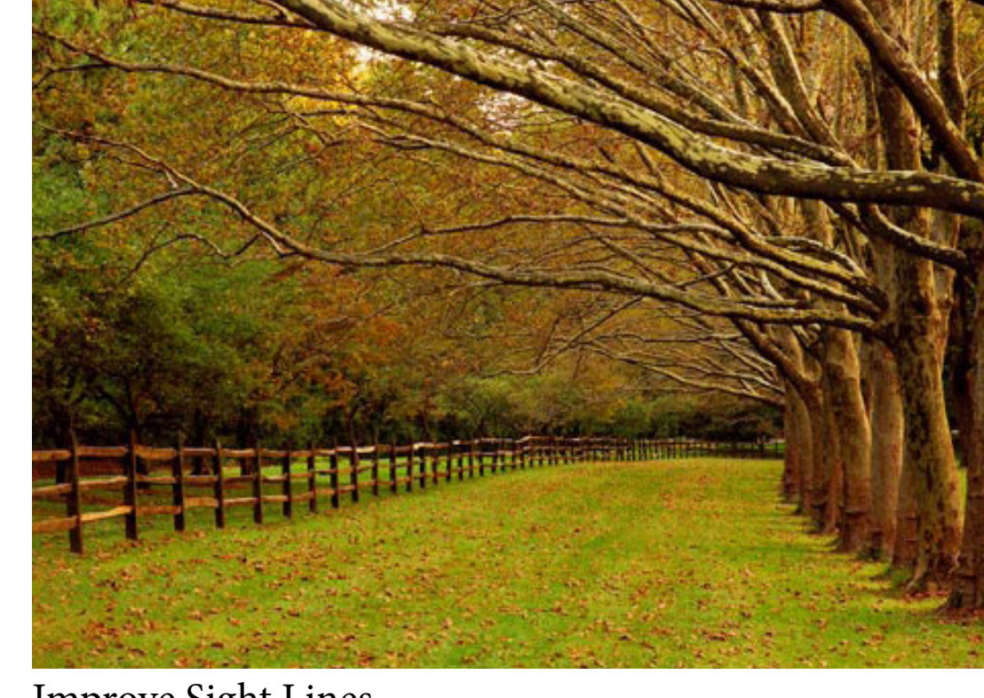
Improve Sight Lines