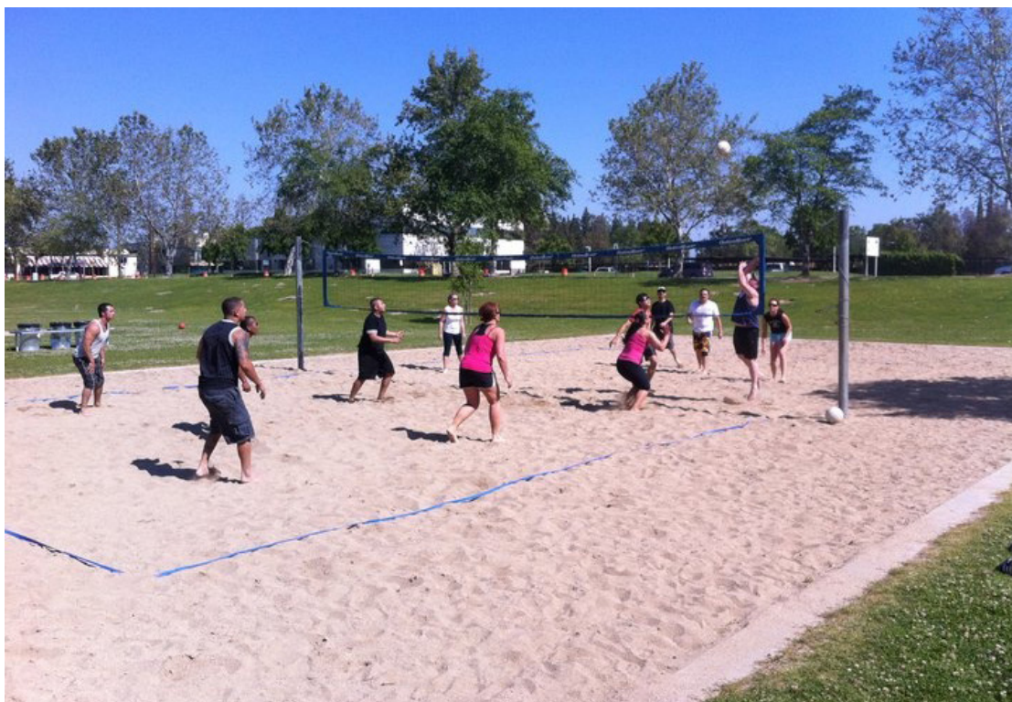
Sand Volleyball Court