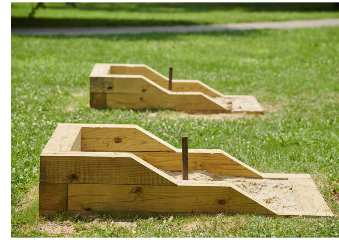
Update Horseshoe Courts