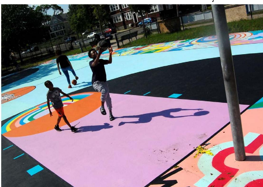
New Basketball Court