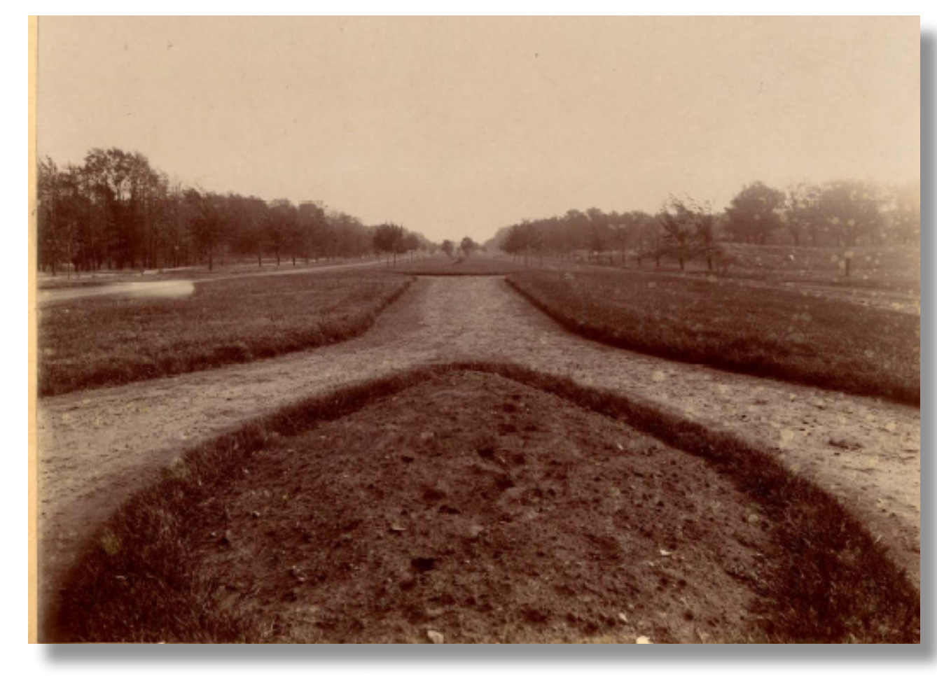
View of Summit Ave. looking west, circa 1900

Historical timeline and photos illustrate points in time during the development of the built road and parkway of Summit Avenue