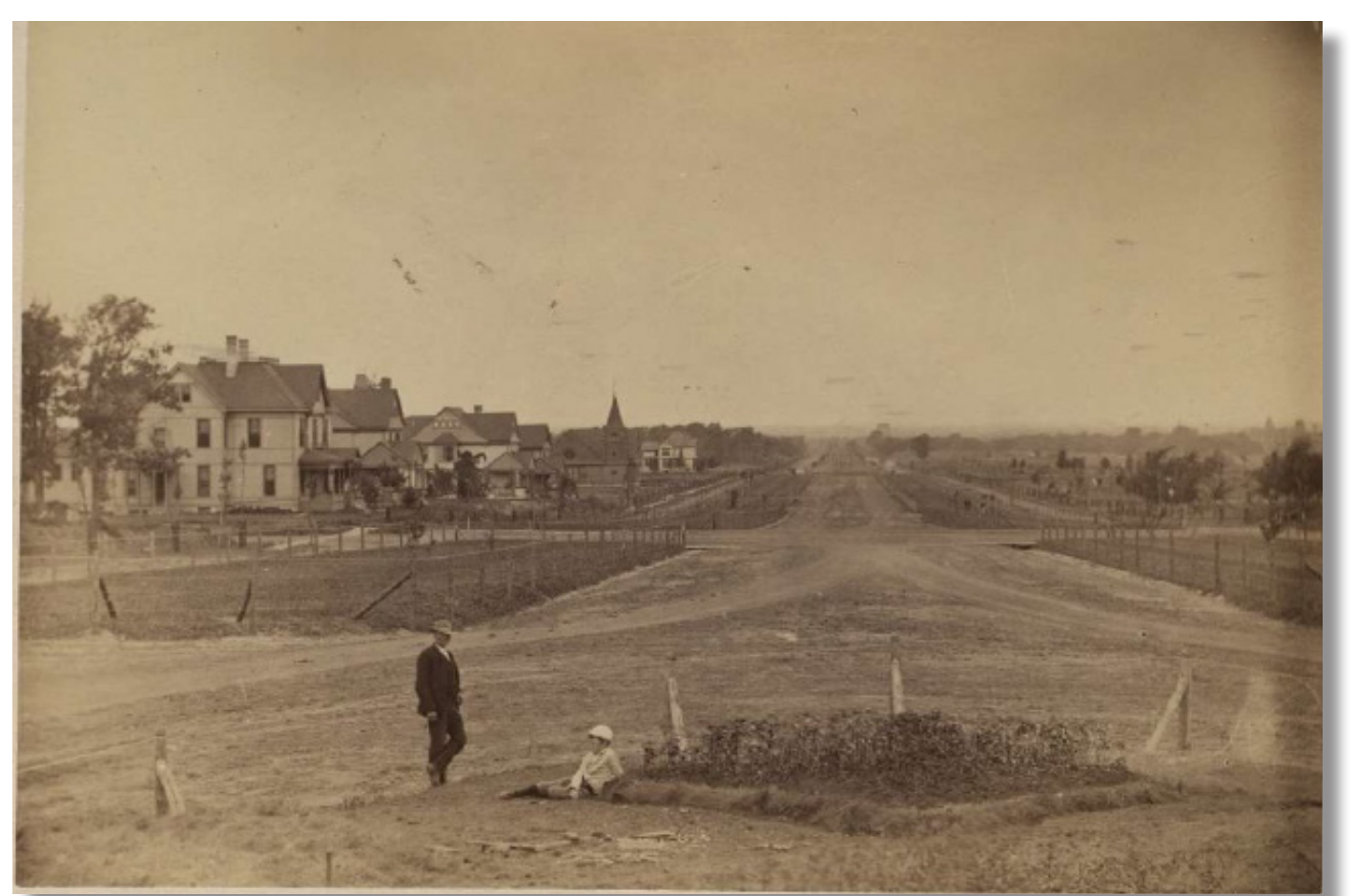
View of Summit Ave. near Macalester College, looking west, 1890

In 1872, The City of Saint Paul hired renowned landscape architect H.W.S. Cleveland to consult on an outline of a planned park system in the city. Cleveland advocated for a parkway system and took note of the opportunity for a parkway on Summit Avenue