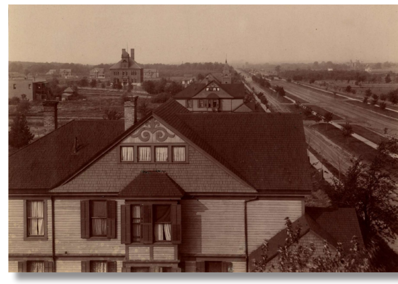
View of Summit Ave from rooftop, looking northwest, circa 1900